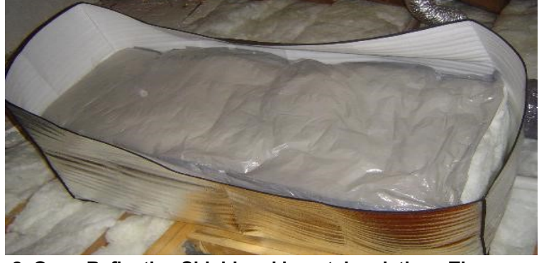
2. Open Reflective Shield and insert insulation. The Battic Door stair cover box is installed over the insulation covering the insulation (insert box open end up).