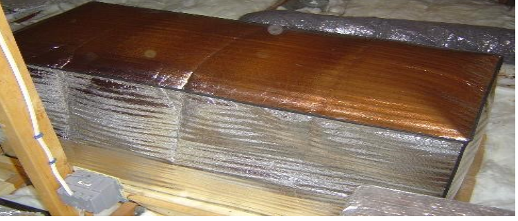
4. Turn the assembled stair cover over and position stair cover over the gasket as you exit the attic. Your attic stairs fold up inside of the stair cover. TIP: If desired, additional insulation may be added to the sides of the stair cover between the shield and cover if clearance allows.