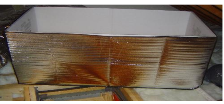
3. GENTLY insert the stair cover box (open end up) into the Reflective Shield covering the insulation. IMPORTANT! The shield fits snug around the stair cover box. To avoid tearing the shield, pull each corner of the shield up 1" at a time, moving from corner to corner.