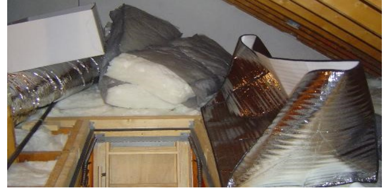
1. Assemble the stair cover box as shown above. Bring assembled stair cover and R-50 Kit components into the attic.

To Open: Lift cover up and move out of the way. Add insulation to maximize the benefits of your stair cover.